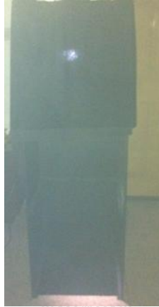
Figure 1. Black Box

was distinguished. Results of the distinguishing process under different light sources can be reflected by measured distances. A greater distance implies better lighting for distinguishing. Figure 1 shows one of the boxes in the experiment.